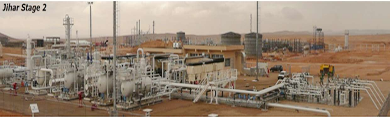
Jihar Stage 2